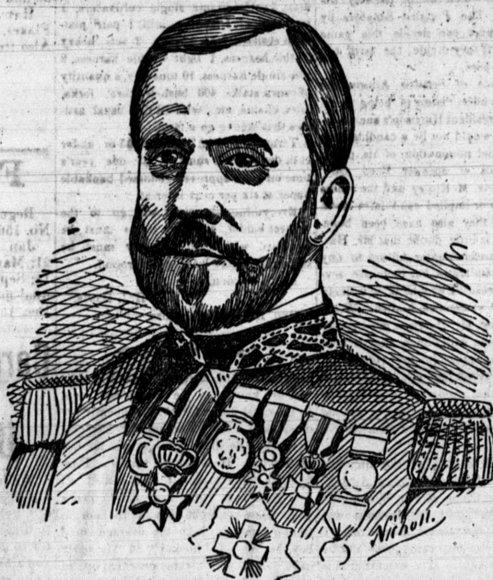
VALERIANO WEYLER Y NICOLAN, New Captain General of the Spanish Forces in Cuba.

Gen. Luque says the troops sustained no macehete wounds, while a number of rebels were wounded by bayonets. The troops finally dispersed the rebels, pursuing them until darkness set in. The insurgents lost 62 killed, while 200